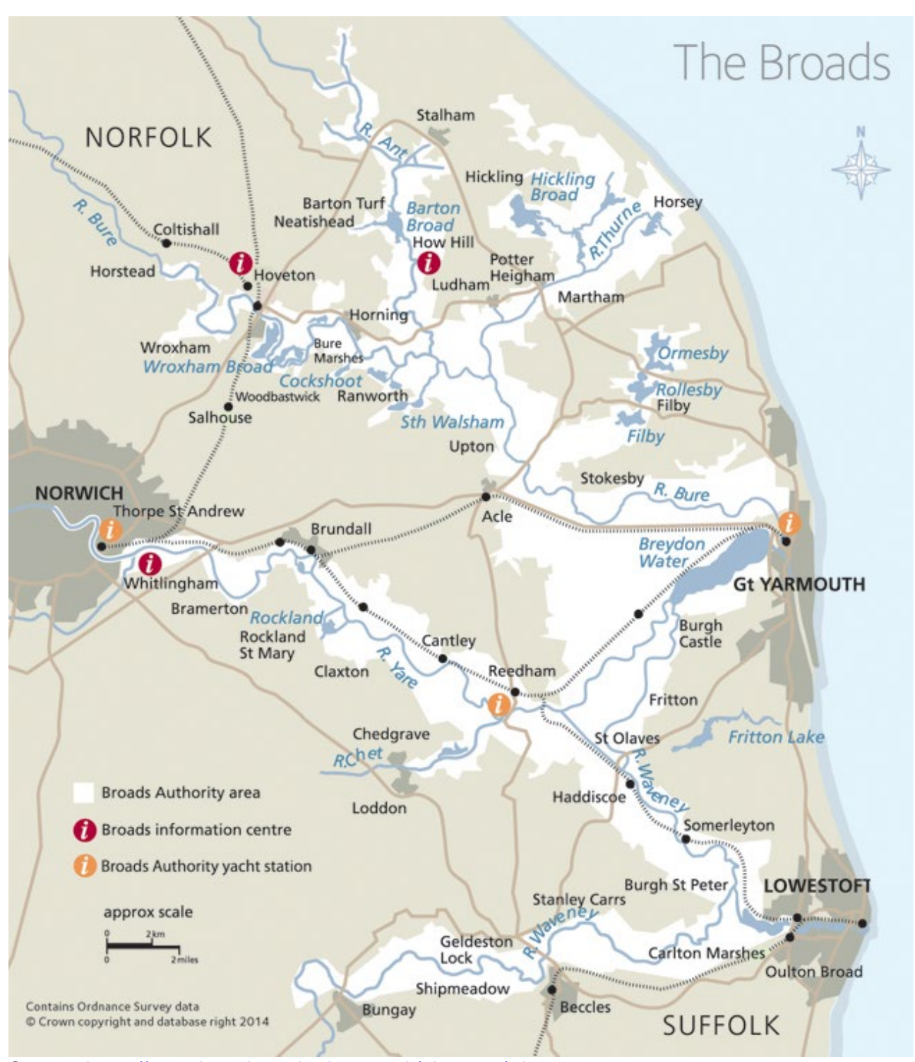
Figure 2: The Broads Authority Executive Area